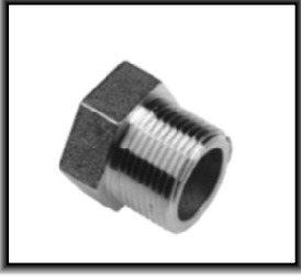
ALTI KÖŞE KÖR TAPA HEXAGON HEAD PLUG