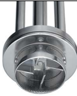
Fine Screen Head