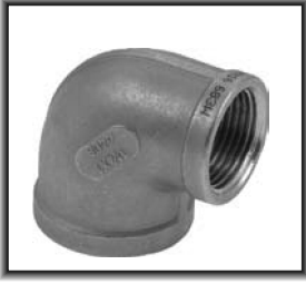
REDÜKSİYONLU DİRSEK 90° REDUCING ELBOW 90°