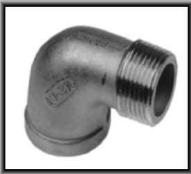
KUYRUKLU DİRSEK 90° ELBOW 90° M/F