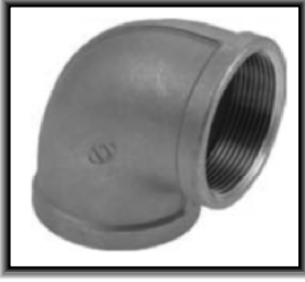
DIŞLİ DİRSEK 90° 0201 ELBOW 90° 0201