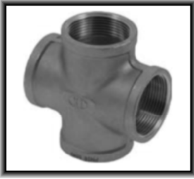
KROS TEE CROSS TEE