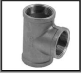
DIŞLİ TEE EQUAL TEE