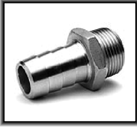
HORTUM AĞZI DIŞLİ HOSE NIPPLE / M