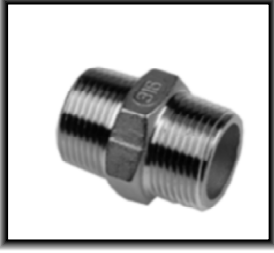
ALTIKÖŞE NİPEL HEXAGON NIPPLE