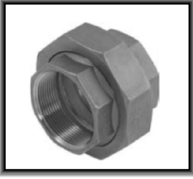
İÇ DİŞLİ DÜZ RAKOR UNION FLAT F/F