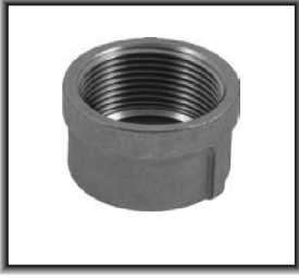
DIŞLİ KÖR KAPAK ROUND CAP